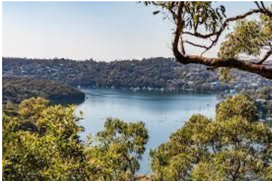
Sugarloaf Bay, Middle Harbour

The Cruising Division has planned a weekend raft-up as well where we can do our own inspections in a more convivial atmosphere (although – of course – the standards are still the same). It is scheduled for the weekend of 19-20 June, 2021.